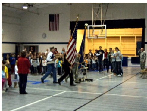
(Left) The Hartford American Legion presents the colors.